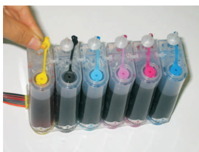
5) Pull out the small rubber plug in the air hole and put air filter into air hole