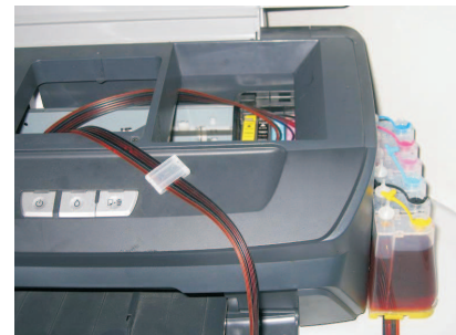
6) Use tube clincher fix the tube on printer