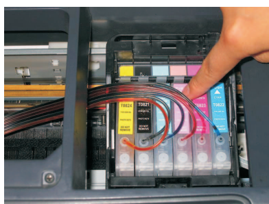
4) Insert the ink cartridge into ink cart, until hearing a click