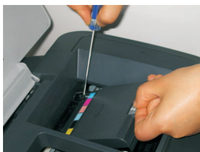
1) Take down the cover of the ink cart by screwdriver