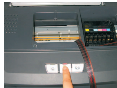
3) Press the Change Cartridge button