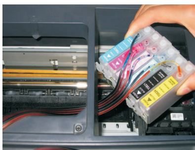
2) Put the ink cartridge from left to right, through the under-side of the printer's beam